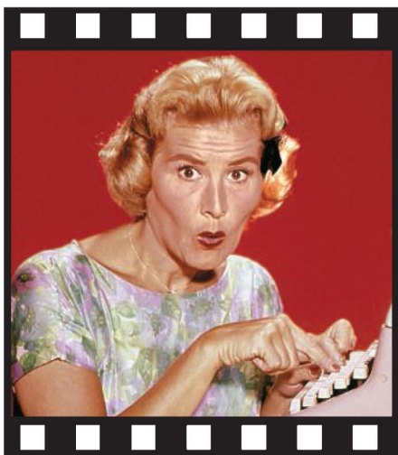
Rose Marie as wisecracker Sally Rogers on The Dick Van Dyke Show in the '60s

R OSE MARIE is facing her last days after the bighearted 87-year-old TV legend fell and broke her right hip in the middle of the night, friends fear.